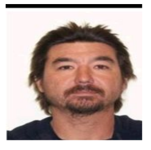
Charge/Offense Rape by force or fear.