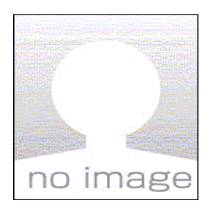
Charge/Offense Assault with intent to commit rape.

Location Details Desert Hot Springs, CA 92240