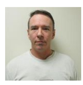
Charge/Offense Oral copulation in concert.

Charge/Offense Lewd or lascivious acts with a child under 14 years of age.