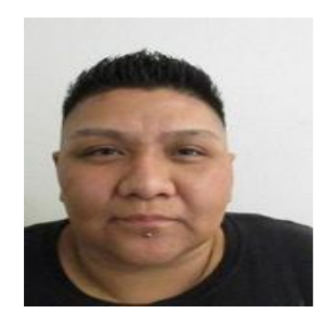
Charge/Offense Assault with intent to commit a specified sex offense.

Charge/Offense Annoy or molest child under 18 years of age.