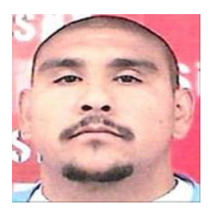
Charge/Offense Rape by force or fear.