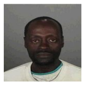
Charge/Offense Oral copulation by force or fear.