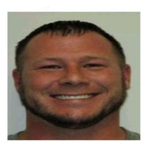
Charge/Offense Oral copulation by force or fear.

Oral copulation with a minor under 14 years of age or by force or fear.