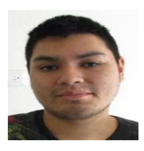
Charge/Offense Lewd or lascivious acts with a child under 14 years of age.

Location Details 8306 Meadows Way, Desert Hot Springs, CA 92240-1498