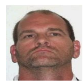
Charge/Offense Prior code: rape by force.

Location Details Desert Hot Springs, CA 92240