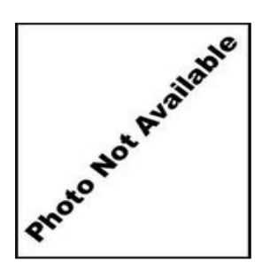
Offense Code CA78719227I5155

Charge/Offense Prior code: lewd or lascivious acts with a child under 14 years of age.