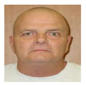
Charge/Offense Sexual battery.