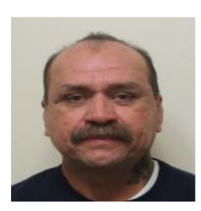
Charge/Offense Prior code: rape by force.

Charge/Offense Lewd or lascivious acts with a child under 14 years of age.