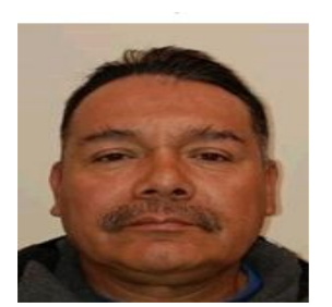
Charge/Offense Prior code: rape by force.

Lewd or lascivious acts with a child under 14 years of age.