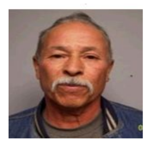
Charge/Offense Assault with intent to commit a specified sex offense.

Location Details 66685 Ironwood Dr # B. Desert Hot Springs, CA 92240-5926