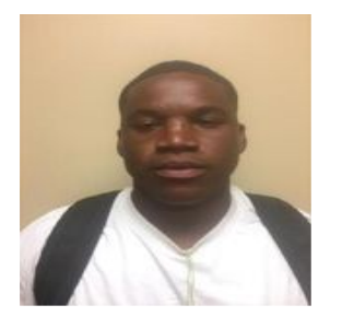
Charge/Offense Oral copulation by force or fear.

Charge/Offense Sexual penetration of victim with foreign object.