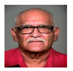
Offense Code CA18617255F8326

Possess/control obscene matter depicting minor in sexual conduct - over 600 images and victims under 12.