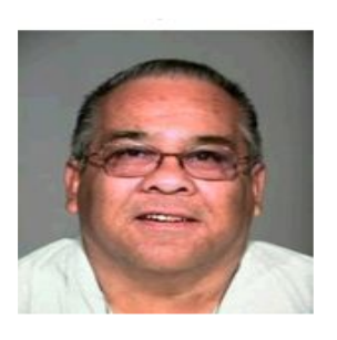
Charge/Offense Lewd or lascivious acts with a child under 14 years of age.