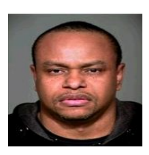
Charge/Offense Sodomy by use of force or injury.