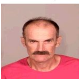
Charge/Offense Prior code: rape by force.