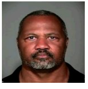
Charge/Offense Prior code: rape by force.