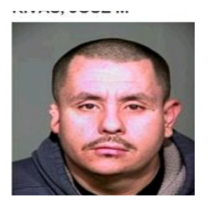
Charge/Offense Rape by force or fear.

Location Details 2727 N Sierra Way, San Bernardino, CA 92405-3553