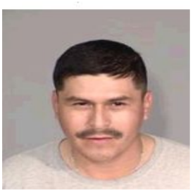
Charge/Offense Rape by force or fear.