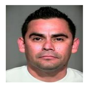
Charge/Offense Lewd or lascivious acts with a child under 14 years of age.