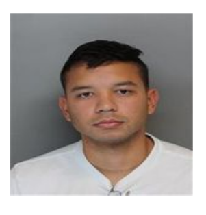
Offense Code SC2303958

Location Details 1045 Spruce St, San Bernardino, CA 92411-2920