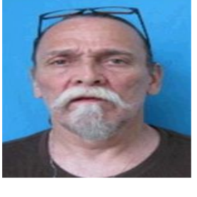
Charge/Offense Rape by force or fear.