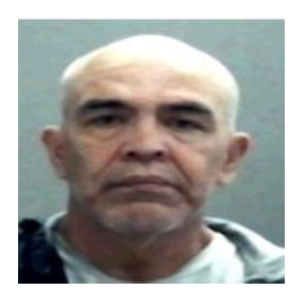
Charge/Offense Prior code: rape by force.