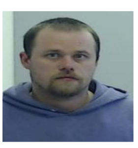
Charge/Offense Prior code: sexual penetration of victim with foreign object by force.