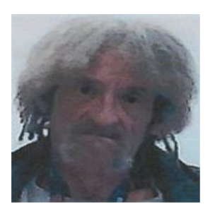
Charge/Offense Indecent exposure.

Lewd or lascivious acts with a child under 14 years of age.