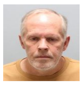
Offense Code CA48219273I6253