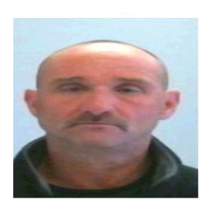
Charge/Offense Sexual battery.

Lewd or lascivious acts with a child under 14 years of age.