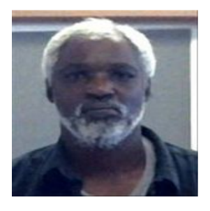
Charge/Offense Non-nys felony sex offense.