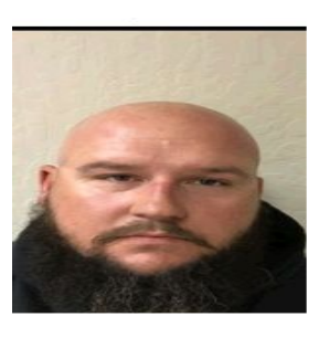
Charge/Offense Oral copulation by force or fear.