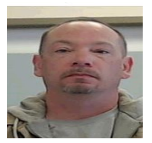
Offense Code CA12917086F4434

Go to arranged meeting with minor with intent to commit a specified sex offense.