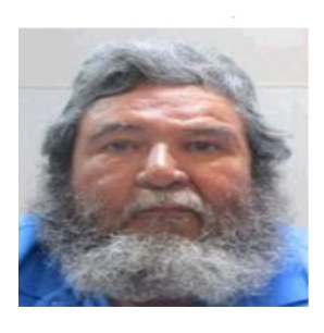
Charge/Offense Sexual battery.

Lewd or lascivious acts with a child under 14 years of age.