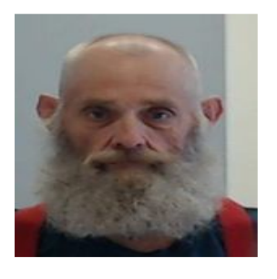
Location Details Transient, Oroville, CA

Assault with intent to commit a specified sex offense.