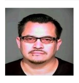
Charge/Offense Assault with intent to commit a specified sex offense.