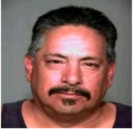
Charge/Offense Prior code: rape by force.

Lewd or lascivious acts with a child under 14 years of age.