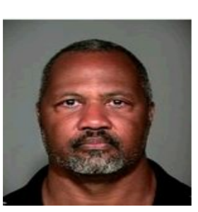
Charge/Offense Prior code: rape by force.