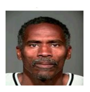
Charge/Offense Prior code: rape by force.

Lewd or lascivious acts with a child under 14 years of age.