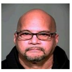
Charge/Offense Rape by force or fear.