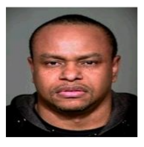
Charge/Offense Sodomy by use of force or injury.

Possess or control obscene matter depicting minor in sexual conduct.