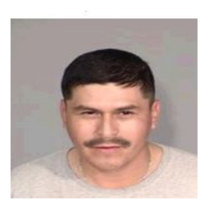
Charge/Offense Rape by force or fear.

Lewd or lascivious acts with a child under 14 years of age.