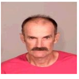
Charge/Offense Prior code: rape by force.