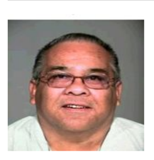
Charge/Offense Lewd or lascivious acts with a child under 14 years of age.