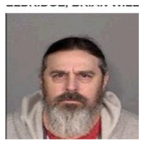
Charge/Offense Continuous sexual abuse of child.

Location Details 1584 Colorado Ave, San Bernardino, CA 92411-1576