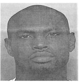
Location Details 3623 Shandin Dr.

Lewd or lascivious acts with a child under 14 years of age.