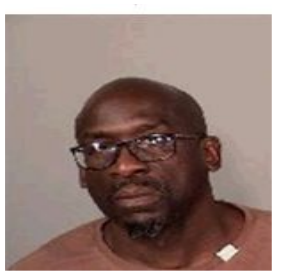
Charge/Offense Prior code: rape by force.