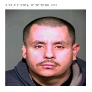
Charge/Offense Rape by force or fear.

Location Details 2727 N Sierra Way, San Bernardino, CA 92405-3553